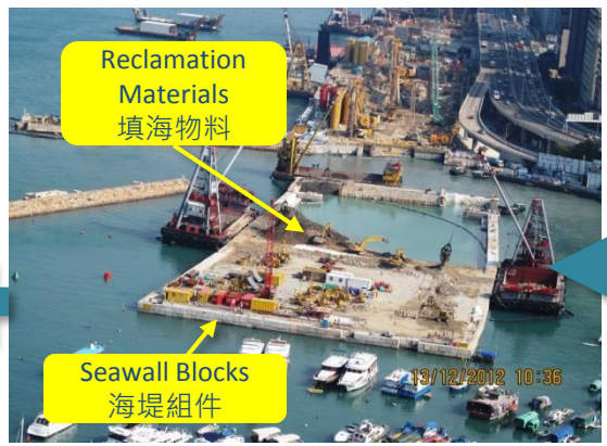
4. Fill Soil within Area Surrounded by Seawall Blocks 於海堤組件範圍內填土