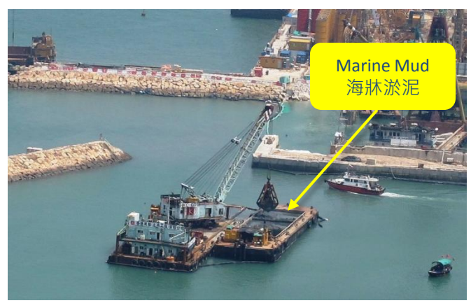
1. Advance Works for Installation of Seawall - Dredging of Seawall Trench 安裝海堤的前期工序- 浚挖海堤壕溝