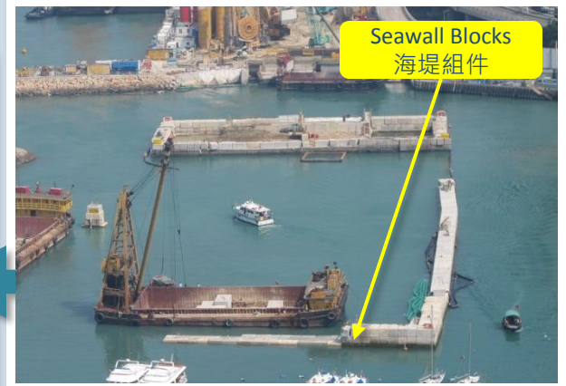
3. Installation of Seawall - Placing Seawall Blocks along the Perimeter of Temporary Reclamation 安裝海堤- 沿臨時填海範圍的邊界安裝海堤組件