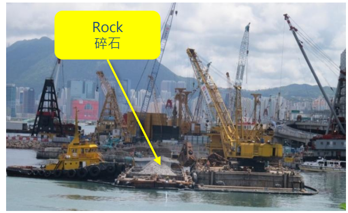
2. Advance Works for Installation of Seawall - Placing Rockfill at Seawall Trench 安裝海堤的前期工序- 於海堤壕溝內填石