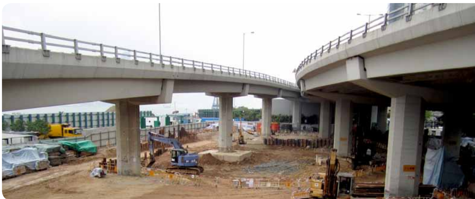
食環署地下停車場的挖掘工程 Excavation for construction of FEHD basement car park

Installation of sheet pile and pipe pile cum grout curtain works, and the excavation for construction of FEHD basement car park are being carried out.