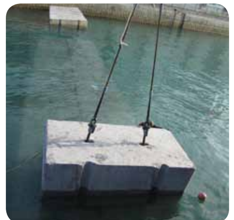
預製海堤組件安裝工程 Installation of seawall blocks