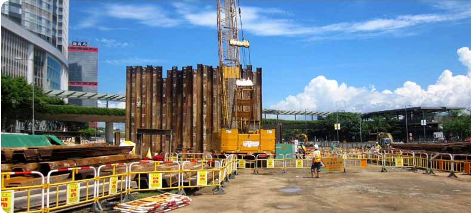
進行中的板樁工程 Sheet piling works in progress

為配合開展隧道建造工程，承建商現正於國際金融中心二期對出之工地範圍豎立圍板，並已於2011年6月展開安裝板樁牆、預鑽孔探土和臨時渠務改道工程。