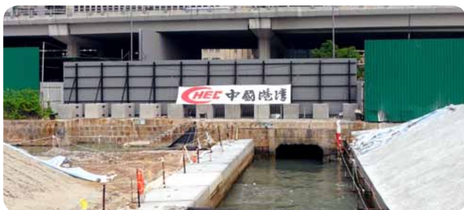
臨時排水系統建造工程 Construction of temporary drainage system

Construction of seawall is being carried out opposite Block 10 of City Garden. At the same time, reclamation and construction of temporary drainage system are in progress at the newly reclaimed land west of Oil Street.