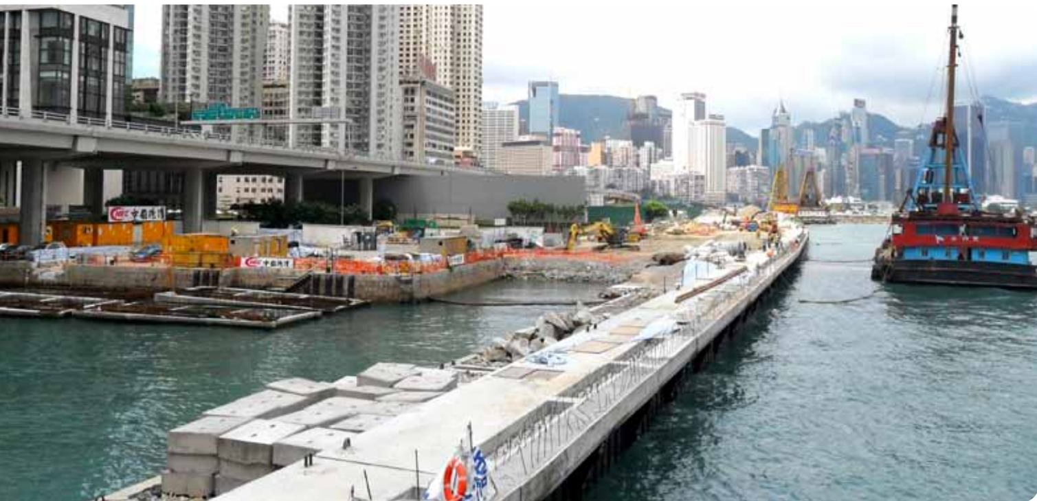
海堤安裝工程 Installation of seawall

北角填海（合約編號：HY/2009/11） North Point Reclamation (Contract no.: HY/2009/11)