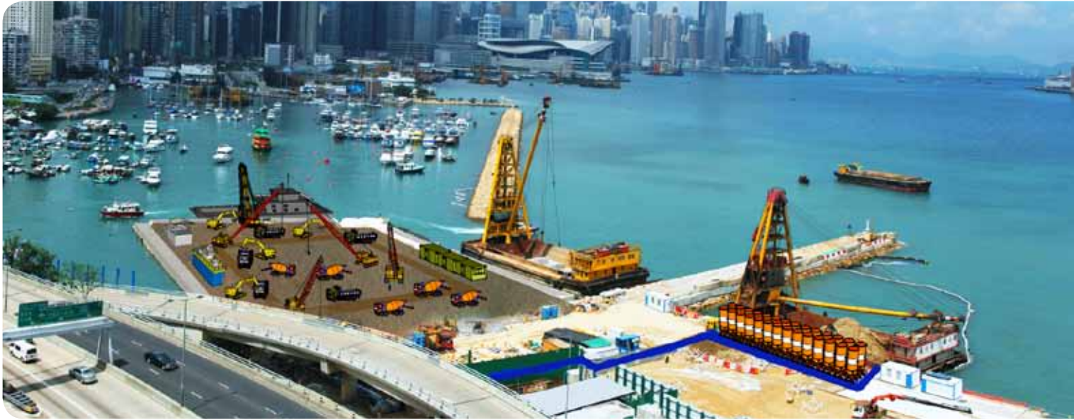
隧道隔牆工程（模擬圖片） Tunnel wall construction (Photomontage)

現正於銅鑼灣避風塘及前灣仔公眾貨物裝卸區進行臨時填海工程，安裝預製海堤組件及於海堤內進行土方工程；而位於避風塘東面，則在進行預鑽孔探土工程，以便安裝垂直隔牆。