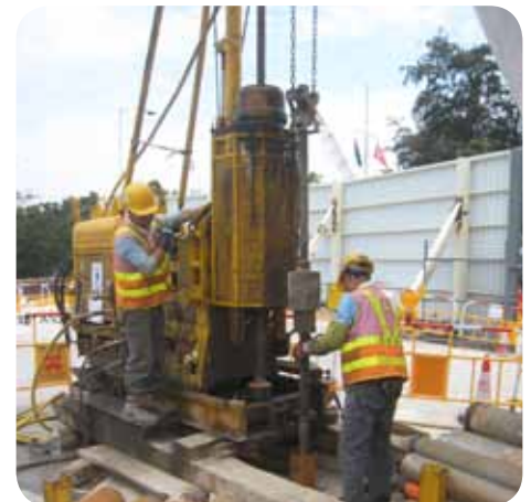
預鑽孔探土工程 Pre-drilling Works

In coming months, construction of cut-and-cover tunnel will begin in the ex-PCWA.